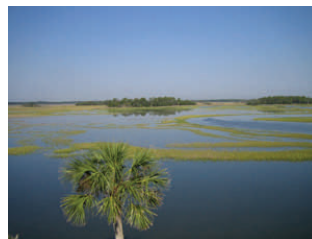
GTM Nat'l Estuarine Research Reserve

The last week of October (the 23rd - 28th) the majority of the staff of JC NERR will be attending an annual NERR's (National Estuarine Research Reserve) meeting near Jacksonville, Florida. The meeting is co-hosted by another Reserve in our system- the Guana Tolomato Matanzas (GTM) NERR, which we are also excited to be visiting during our time there!